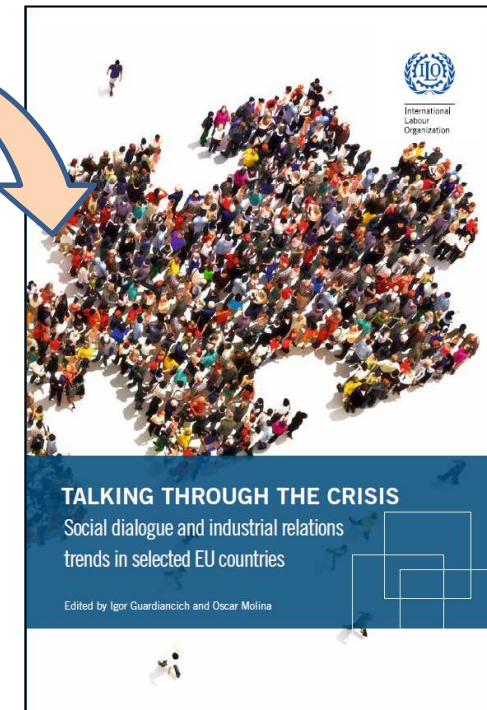
<그림 6> ILO Publications

http://www.ilo.org/global/publications/lang-en/index.htm